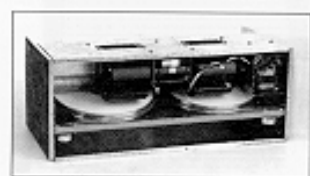
ENERGY RECOVERY VENTILATOR

The WERV consists of a unique "rotary energy recovery cassette" that provides effective sensible and latent heat transfer capabilities during summer and winter conditions. Various control schemes are addressed including limiting ventilation during building occupancy only.