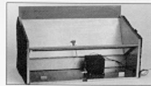
COMMERCIAL ROOM VENTILATOR

A blank off plate is installed on the inside of the service door. It covers the air inlet openings which restricts any outside air from entering the unit. The blank off plate should be utilized in applications where outside air is not required to be mixed with the conditioned air.