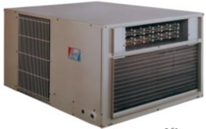
Basic model P1136A2 shown with Electric Heater Package

Before purchasing this appliance, read important energy cost and efficiency information available from your retailer.